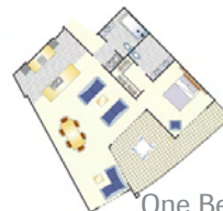
One Bedroom Deluxe