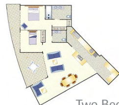
Two Bedroom Deluxe