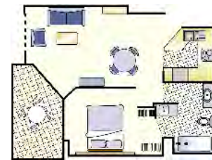
One Bed Courtyard

Floor plans are indicative only and may vary per apartment.