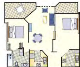
Two Bed River